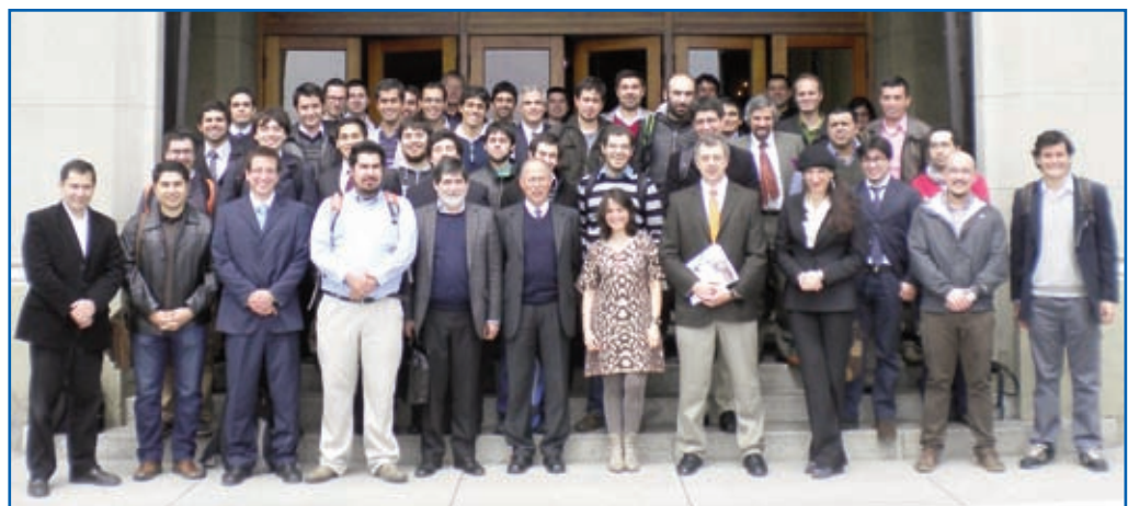
Figures 3: Participants to the XI Workshop on Computational Mechanics JMC 2012 at Universidad Técnica Federico Santa María at Valparaíso